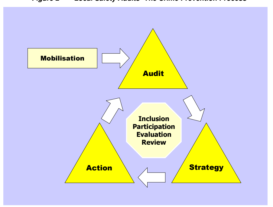
Figure 2 Local Safety Audits -The Crime Prevention Process<sup>108</sup>

At all stages of the process, the inclusion and participation of both men and women and of hard-to-reach populations such as minority groups, the elderly, children and young people need to receive specific attention.