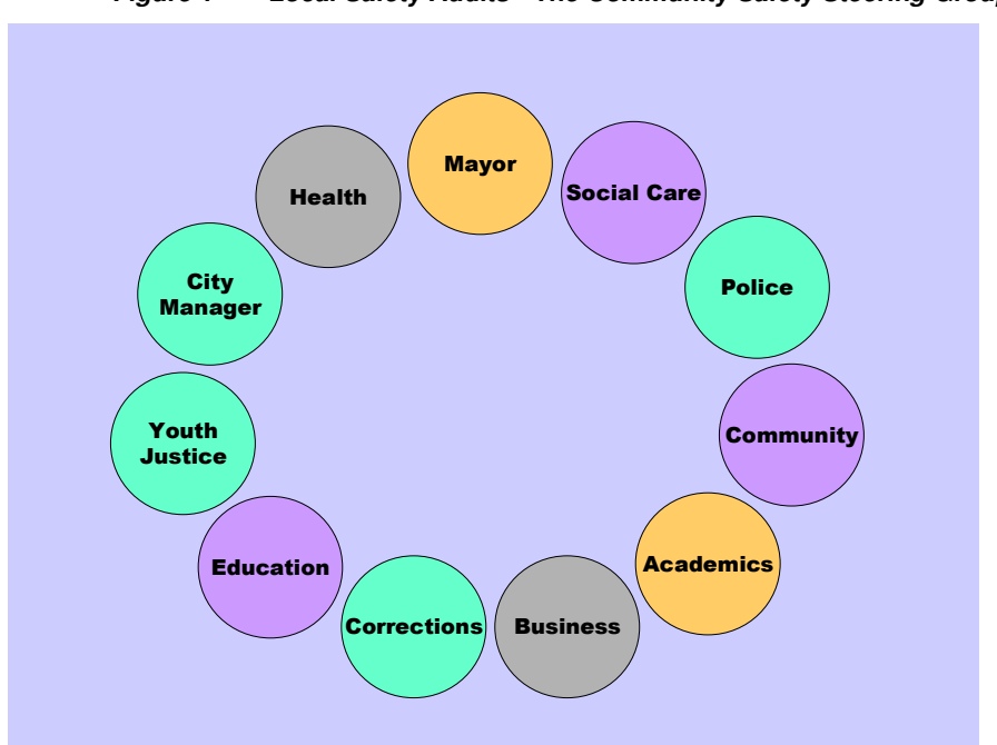
Figure 1 Local Safety Audits - The Community Safety Steering Group

Figure 2 provides a visual outline of the sequence of the planning process, from mobilization of the steering group, conduct of the safety audit, developing a local strategy, implementing the strategy in the action plan, and evaluating its process and outcomes, which in turn provides input to the next safety audit. This allows for problems encountered in the first action plan and implementation, or new concerns to be addressed in subsequent phases.